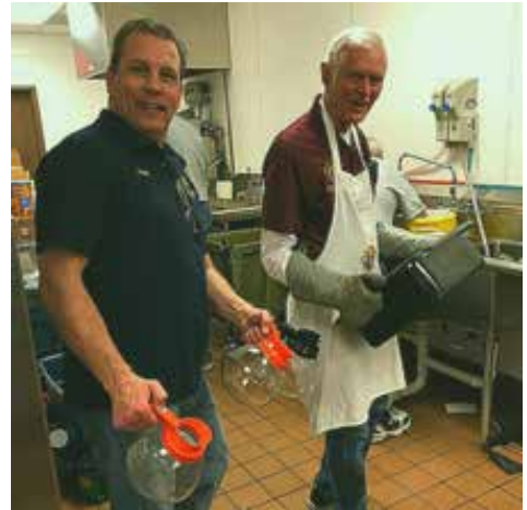
Council 2160 in Greeley providing a full fish and shrimp dinner at St. Mary Parish Hall to help support the youth group.