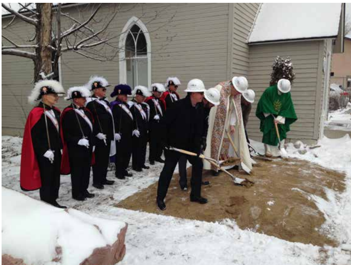
Despite cold weather, 4th degree Knights fielded an honor guard as ground was broken for the new Parish center/ Adoration Chapel in Monument, Colorado. Council 11514.