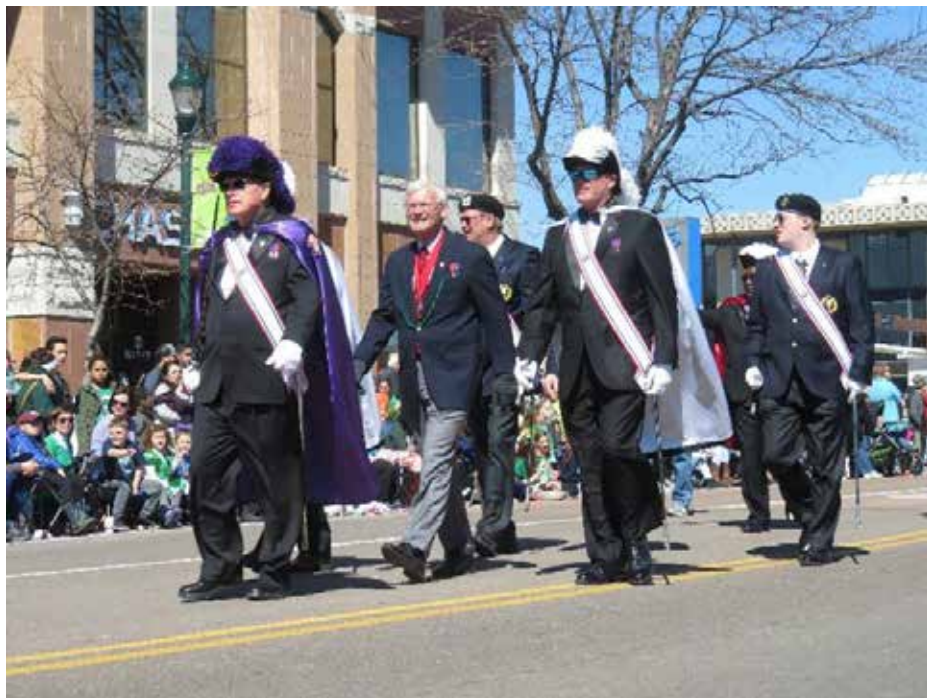
4th Degree Knights participating in the St. Patrick's Day Parade conducted downtown in Colorado Springs on Saturday, March 16.